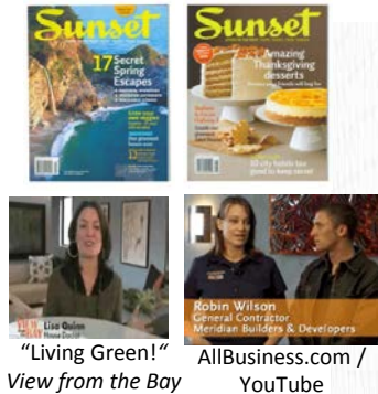
"Living Green!" View from the Bay