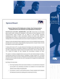
Project Digital Media Kit

SPG: Communication Systems & Services Title: Will You Be Ready? How the Communications Industry is Surviving While Planning for a Robust Future # Prospect Participants: 48 Alliance Partner: Telecommunications Industry Assn Sales Operations: - Managed sales dashboard; shared project goals, successes and deliverables w/ project team - Secured speaking roles at two TIA Forums # Leads: 27 New Revenue: $725K