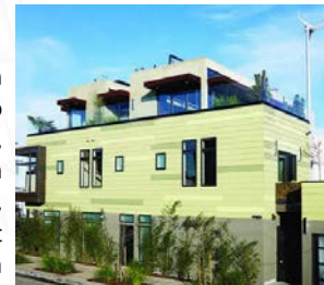
San Francisco Idea House, Mission District, 25 th Street @ Alabama