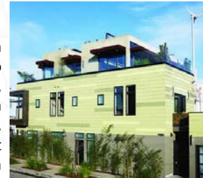
San Francisco Idea House, Mission District, 25 th Street @ Alabama