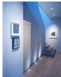
Meridian Portfolio: 19 Carmel St. project