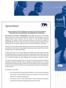
Project Digital Media Kit